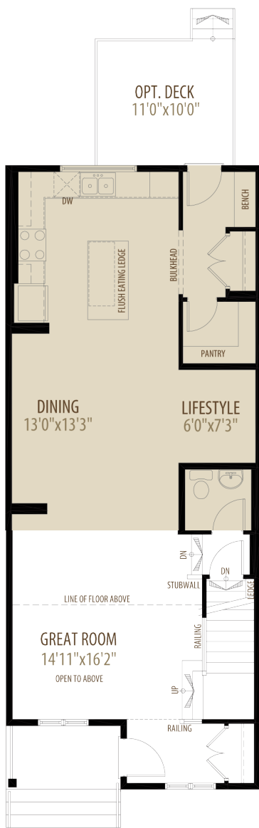
Main Floor 935 sq ft