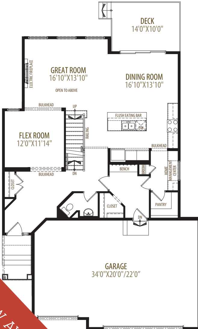
Main Floor 1,254 sq ft