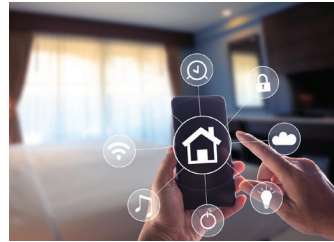
FLEXIBLE SMART HOME FEATURES